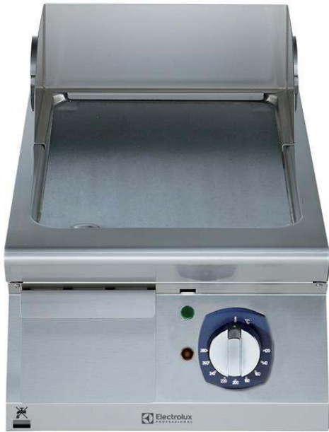
371328 (E7IINDAOMCA) Half module electric Fry Top with smooth brushed chrome cooking Plate, horizontal, thermostatic control, scraper and sTopper included