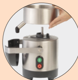
Stainless-steel bowl and motor unit for easy aftercare