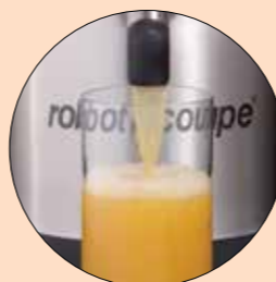
High output and unrivalled juice quality