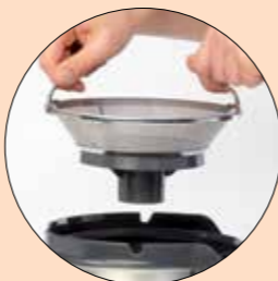
Removable stainless-steel basket