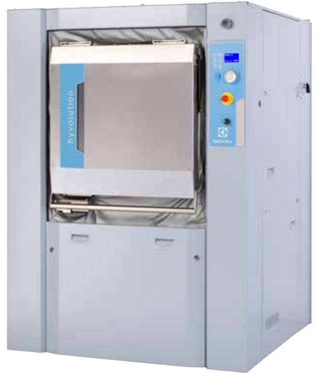
Images shown are a representation of the product only and variations may occur.